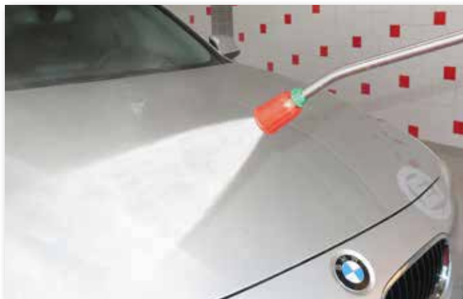
High pressure cleaning with lance and stainless steel flat jet nozzle