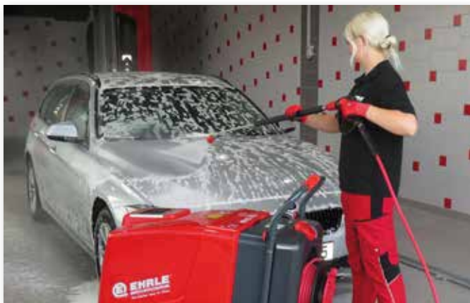
Car cleaning with lance and stainless steel flat jet nozzle