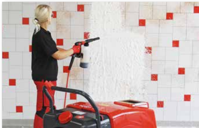
Pre-spray with attachment kit SoftFoam lance, Art. No. 410702