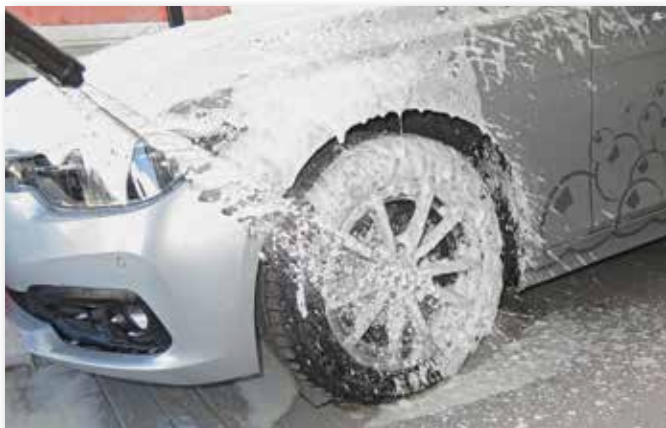
Car cleaning with attachment kit SoftFoam lance, Art. No. 410702