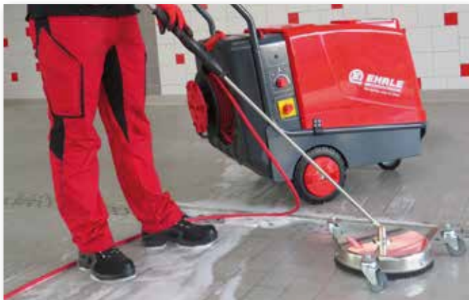
Area cleaner stainless steel in use Ø 300mm, Art. No. 394078