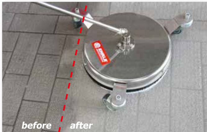
Area cleaner stainless steel Ø 410mm, Art. No. 394079